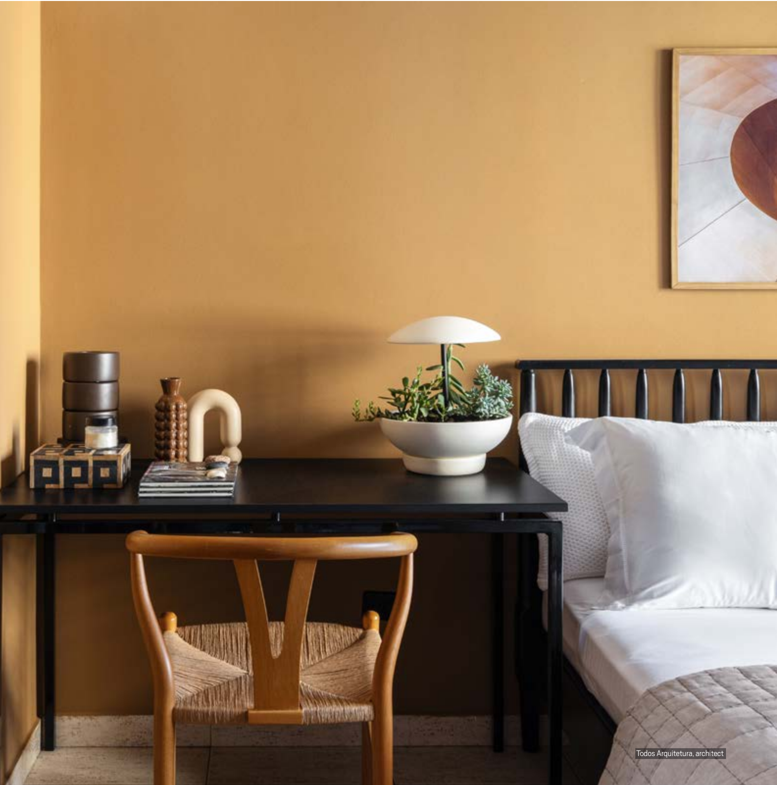
Todos Arquitetura, architect